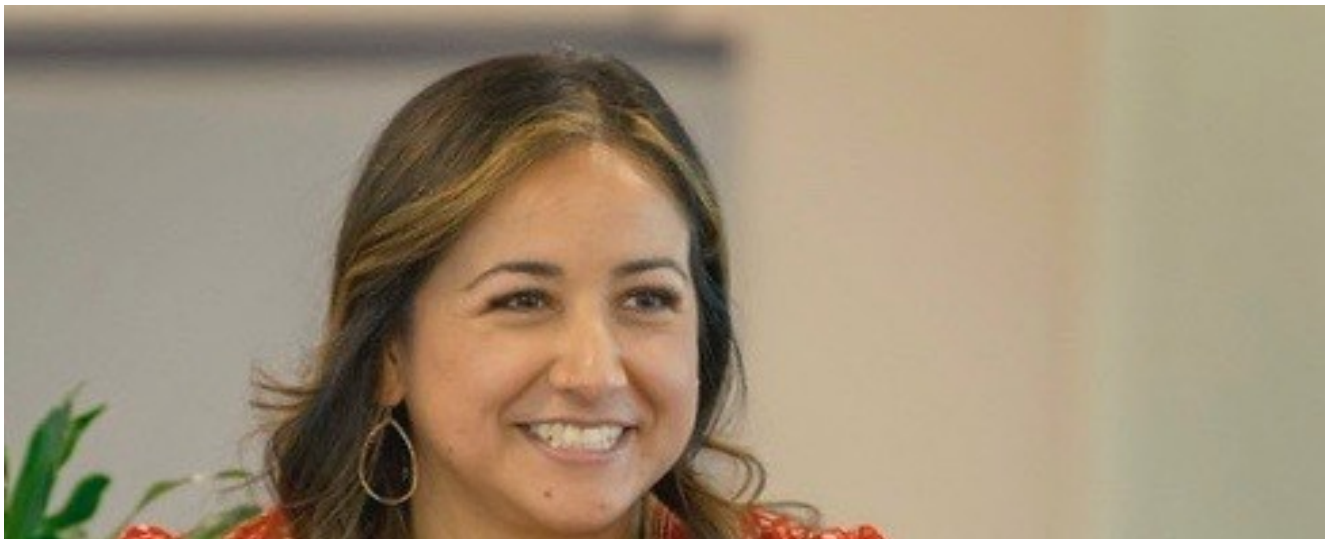
DBE Advisory Committee

Review Proposed DBE Goal for 2023 - 2025.