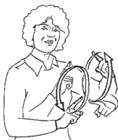
SIGN, SIGN LANGUAGE