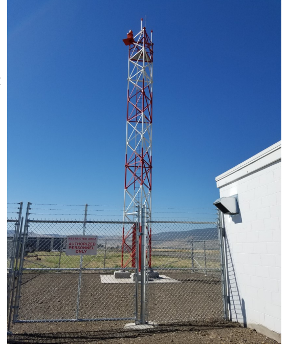
La Grande Beacon & Beacon Tower Improvement

See ODA website and e-grants portal for details!