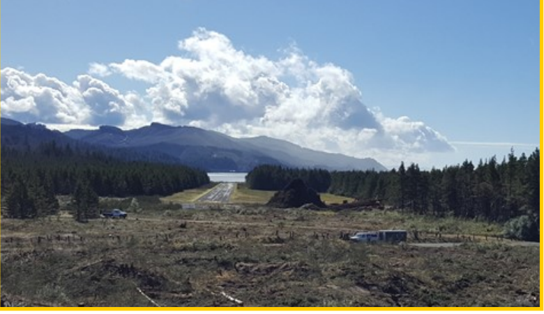
Nehalem Bay Obstruction Removal—before