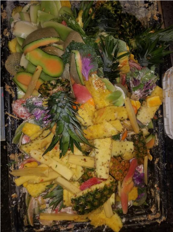
Figure A1: Inedible food waste comprising of fruit and vegetable trimmings.