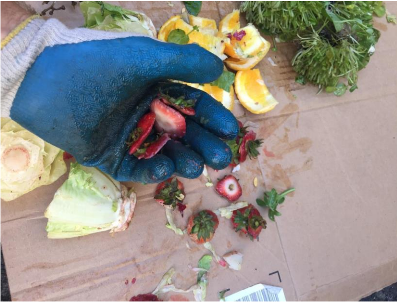
Figure A3: Inedible food waste, featuring strawberry tops, with tightly trimmed cilantro stems in the background.