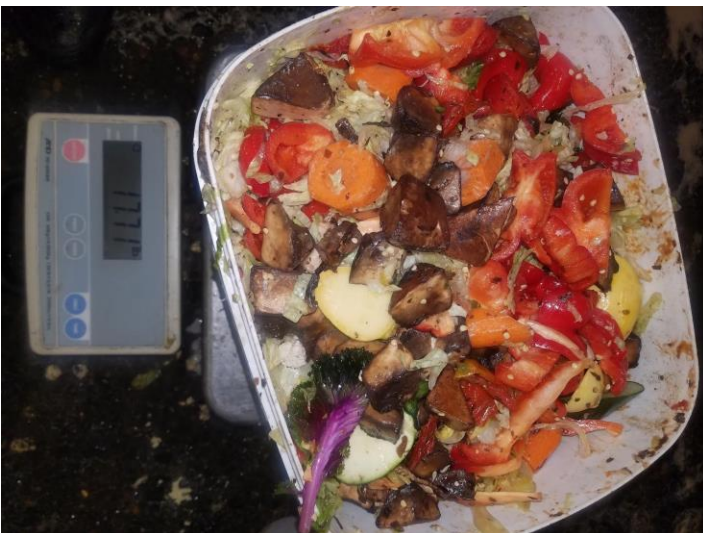
Figure A2: Edible vegetable and fruit waste including pepper tops, carrots, squash and mushrooms.