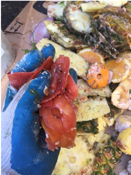
Figure A4: Thinly sliced tomato tops.