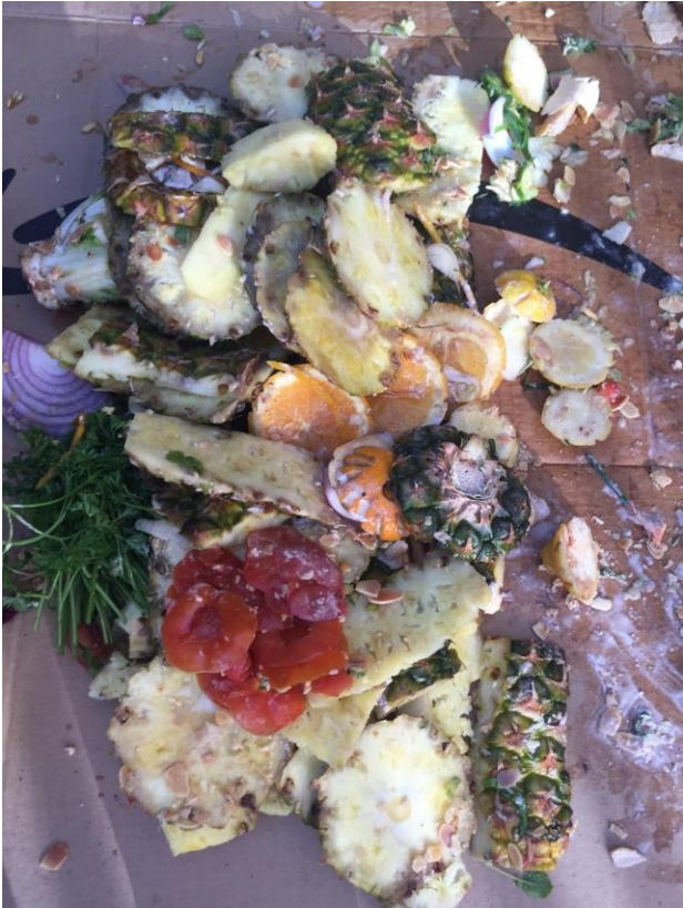
Figure A6: Inedible wasted food, namely, pineapple trim.