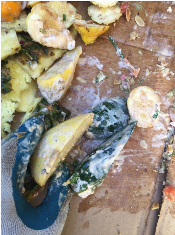
Figure A5: Squash ends, considered edible wasted food.