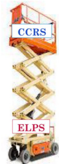
Figure 1 3

Oregon Adult English Language Proficiency Standards (OAELPS) are closely connected to the Oregon Adult College and Career Readiness Standards (OACCRS). OAELPS are intended to support English language ABS learners in meeting the OACCRS, whether they are in English language learning classes or in other types of ABS classes such as GED and Adult Education (see Figure 1). It is expected that as learners advance in their English language skills, there will be increasing use of OACCRS with decreasing OAELPS support, as illustrated in Figure 2 below.