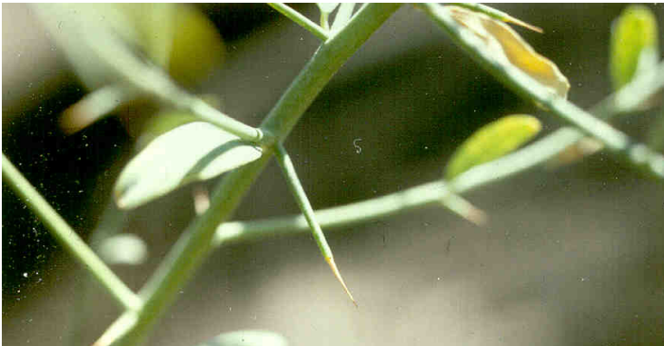
Camelthorn thorns and flowers

Introduction: Camelthorn, Alhagi maurorum , is a member of the pea or Fabaceae family, it was introduced into California around 1915 from Turkey as an alfalfa seed contaminant and in camel dung packing material around date shoots. It is now found in nine states.