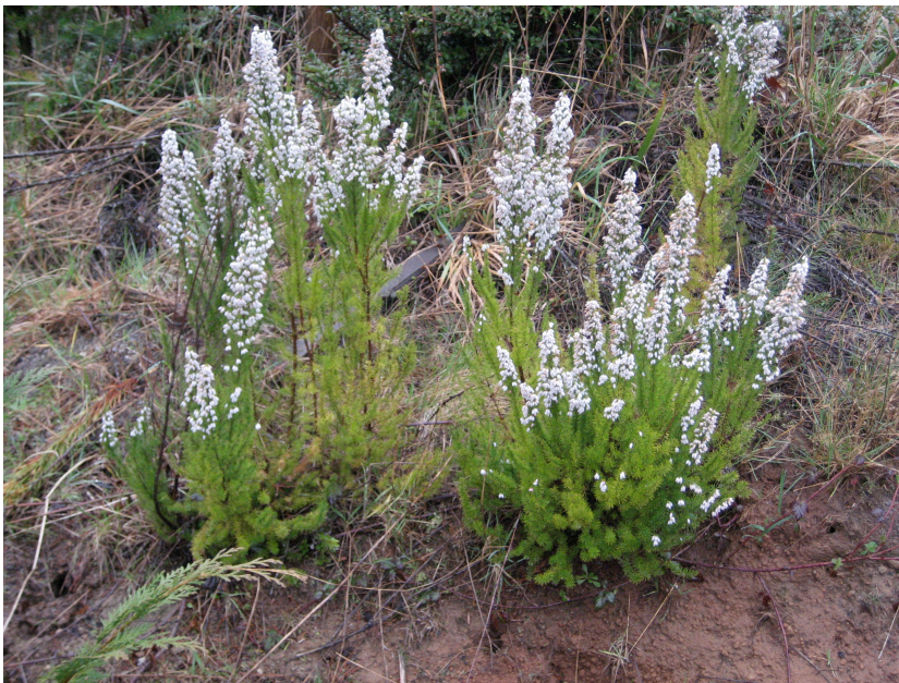
Spanish heath shrubs

Introduction: Spanish heath is a weedy ornamental of the Erica species known from only a few sites in Curry, Coos, and Benton Counties in Oregon. First established in Oregon in the 1970’s, at a rare plant nursery near Langlois, it spread slowly for decades until recently. Now its population is increasing exponentially (Stansell, McKenzie 2008 pers. comm). Growing up to 10’ tall, this species produces up to 9 million seeds per plant (Weeds of Australia, 2007) and is capable of forming dense stands in forest lands, wild areas, pastureland and on right-of-ways and will be a troublesome weed to control, should it be allowed to spread in western Oregon. Spanish heath has infested large areas in