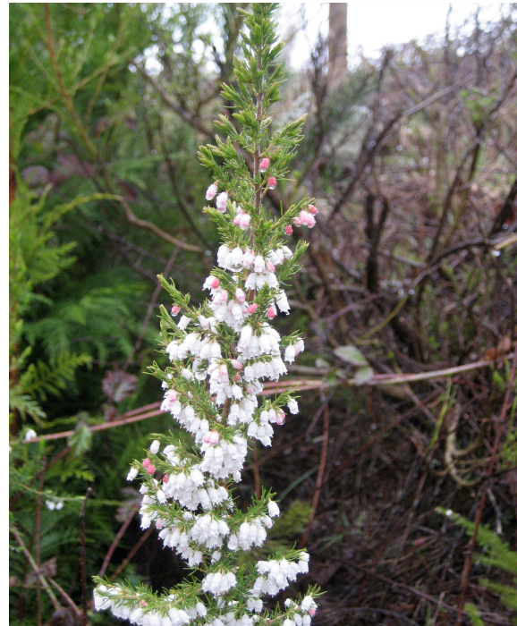
Spanish heath in Oregon, photo by Ken French, ODA

Native Range: Spanish heath is from southwest France, north and western Spain and Portugal. It will grow in most soils and especially prefers acidic conditions.