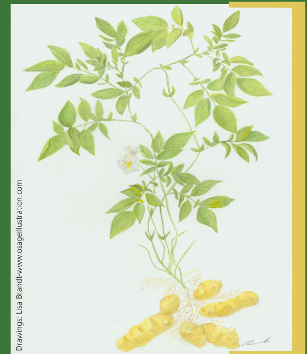
Drawings: Lisa Brandt-www.osageillustration.com

establish their empire on the western shores of North America. In the spring of 1791 they established a fort at Neah Bay and as was the custom, a garden was planted that surely included potatoes they brought directly from South America via Mexico. Over the winter of 1791 the Spanish found the weather conditions in the harbor too severe to maintain their ships and they abandoned the fort. The Makah people, who were in need of a carbohydrate source, likely found volunteers of this rather weedy plant left in the garden of the abandoned fort. They quickly adopted the potato and became its stewards, growing it in their backyard gardens. Not until the late 1980's was this potato grown outside the Makah Nation. To date there has been limited commercial production of this potato, although it is now grown by a few small farmers. Interest in the Makah Ozette is increasing. The firm flesh and creamy texture of this thin-skinned knobby potato and its unique nutty, earthy flavor are appreciated by home cooks as well as chefs.