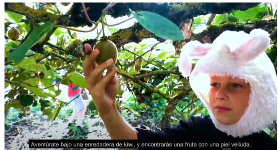
A Spanish language version of the Kiwi video .

The Oregon Department of Education's Child Nutrition Program and OSU Extension's Food Hero campaign have teamed up to launch this series which will include a total of 50 videos when complete. The series aims to educate students on healthy, Oregon food. For a comprehensive list of the videos we have available to date visit the Oregon Harvest for Schools website and click on the Videos tab under "Other Items."