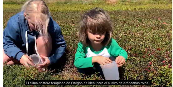
A Spanish language version of the Cranberries video .