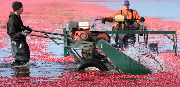
An English language version of the Cranberries video .

The month of November brings new additions to the Oregon Harvest for Schools (OH4S) video series; Cranberries in English and Spanish and Kiwis in English and Spanish!