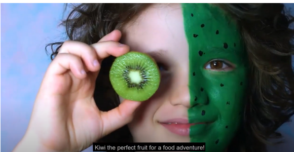
An English language version of the Kiwi video .