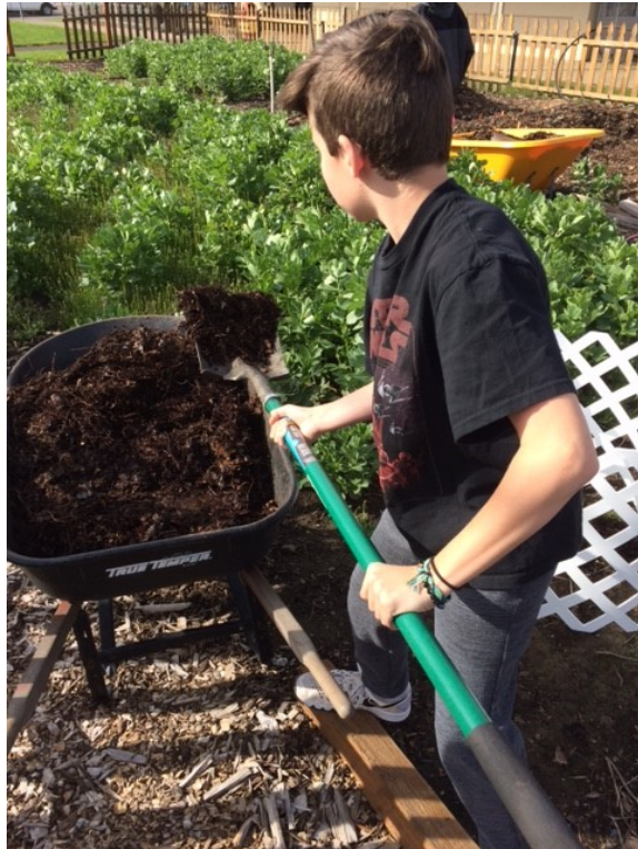
Use what you have! They didn't have straw, but had lots of leaves. It worked!