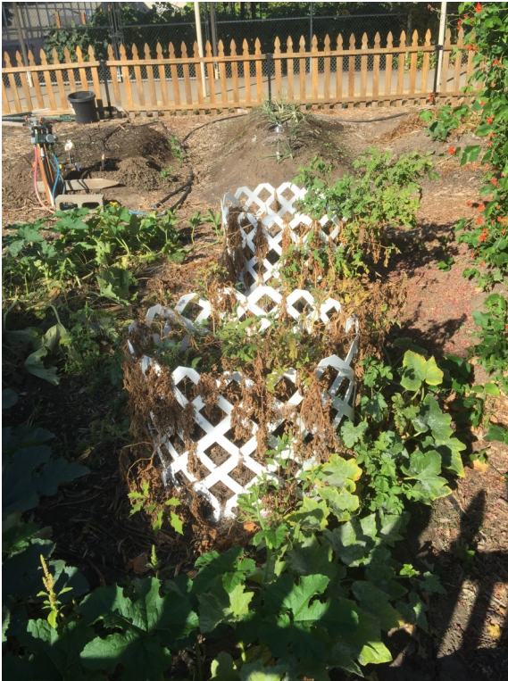
The plants start dying, you can harvest