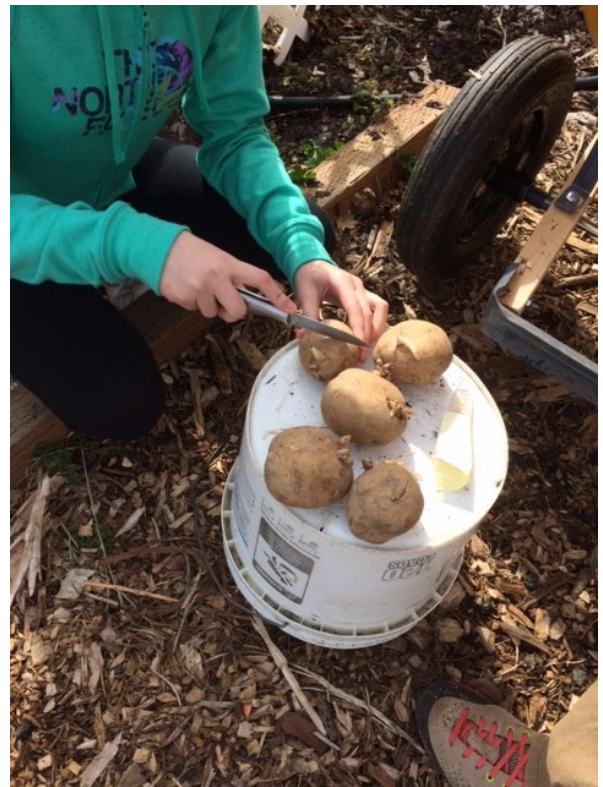
They did two towers. One for the makah's and one for another variety