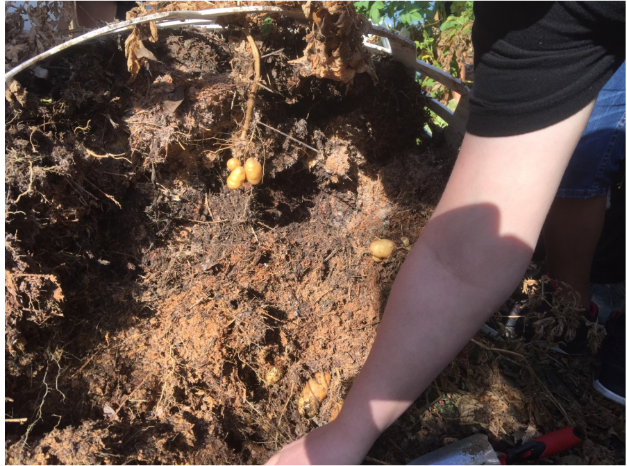
Knocked the tower over, emptied contents, dig through to find spuds.