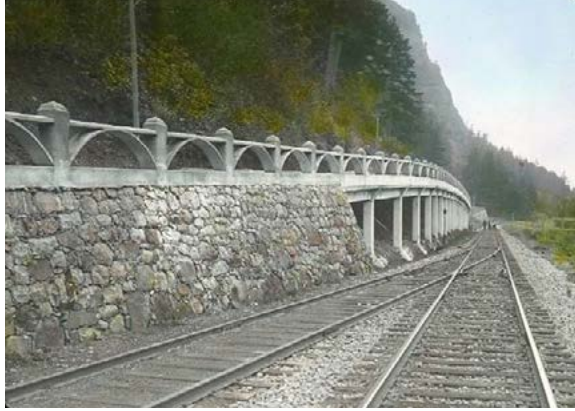
Historic view of the west viaduct, soon after opening in 1914.

Construction is underway for multiple projects in the Columbia River Gorge between I-205 and Hood River to improve Interstate 84 and extend the Historic Columbia River Highway State Trail.