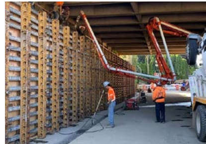
Crews work under I-5 to build a new structure over SW 26th Avenue in Portland.