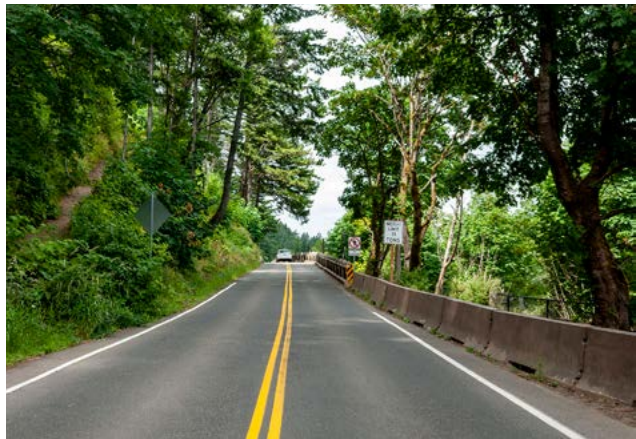
Current view of the west viaduct on the Historic Columbia River Highway.

For more information about projects in the Columbia River Gorge visit i84GorgeConstruction.org