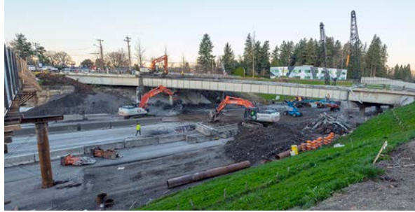
Crews demolish the SW Hall Boulevard overpass in Tigard during a weekend highway closure.

For more information visit the project website: bit.ly/swi-5repair