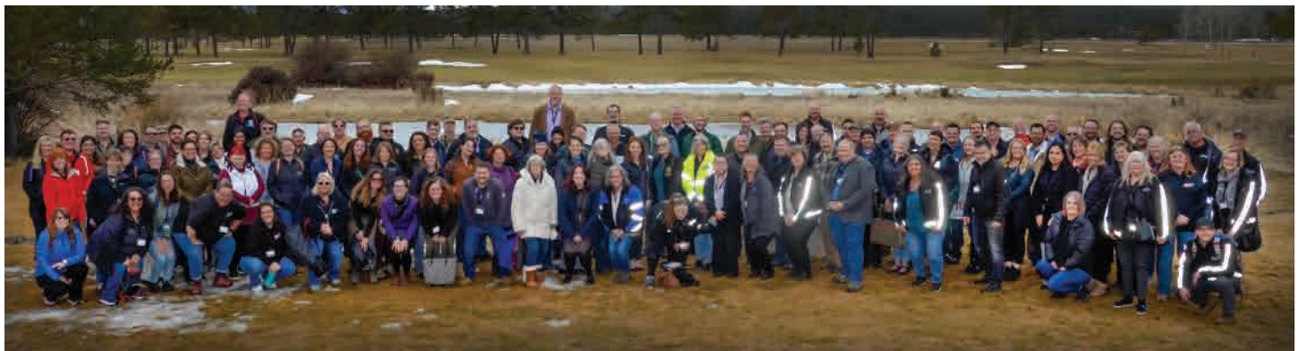
OREGON PREPARED WORKSHOP 2023