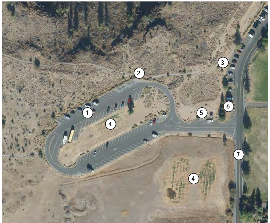
Figure 18: Welcome Center Existing Condition