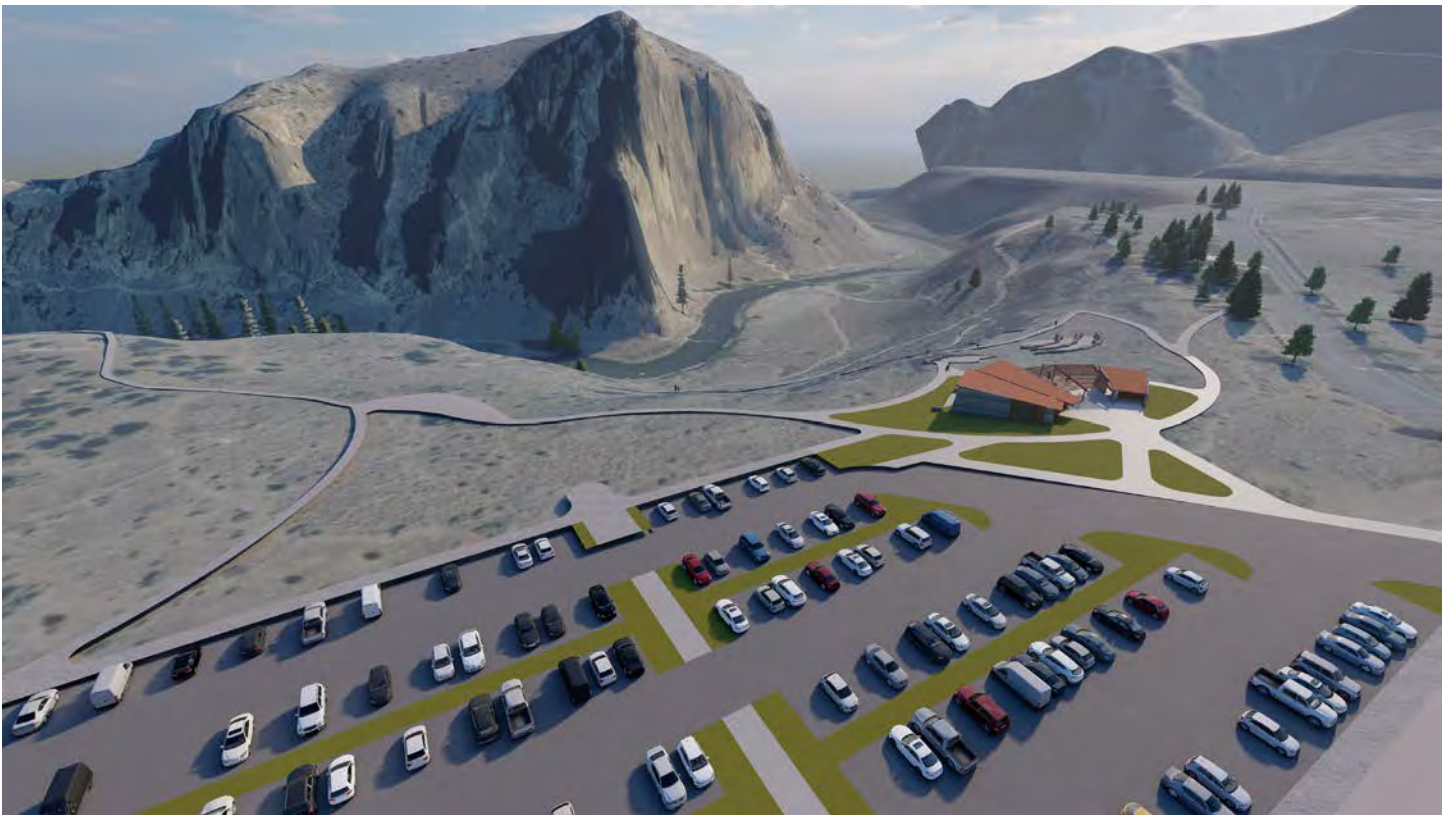
Figure 20: Welcome Center Perspective