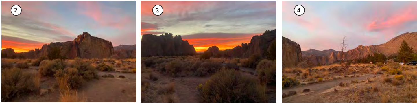
Figure 19: Welcome Center Viewshed