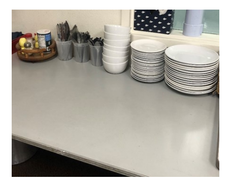
No more single use plastics in the breakroom