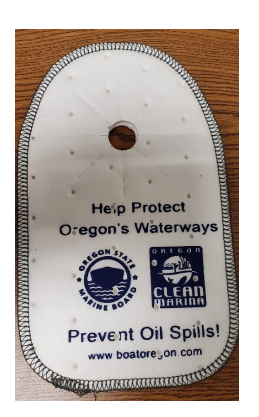
Fuel nozzle bib

Oil spill reporting and certification sign—11"x17"