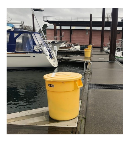
Emergency oil spill kits are kept on all moorage docks