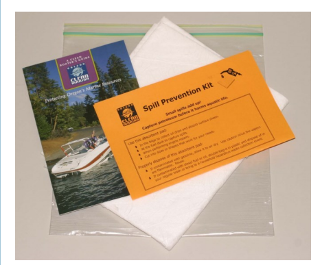
Boater spill kit—boxes of 40 kits

Oil spill reporting and certification sign—11"x17"