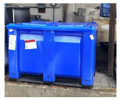
Waste boat paint storage bin stored under cover