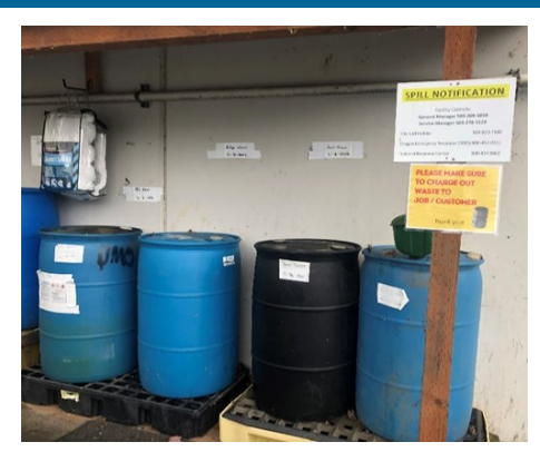
Very organized waste storage area with spill containment pallets. All labeled according to requirements