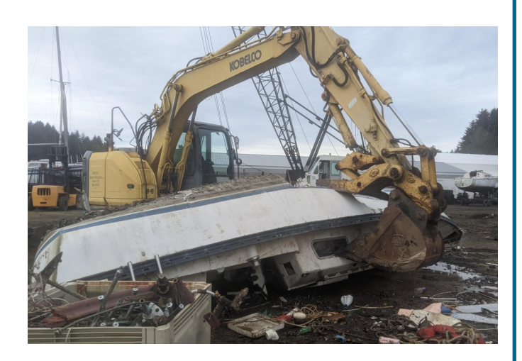
The final project was with the Port of Newport and was completed in June 2022.

This marina management challenge is one that can at times be complicated and frustrating to work through. Additionally, there have been reported ADVs at Clean Marinas since the conclusion of this project that the Marine Board is not fiscally able to assist with at this time. All that being said, the OSMB is very grateful for the support and collaboration of numerous partners on this project, and we will continue to seek opportunities to work with stakeholders on innovative ways to help prevent and address abandoned and derelict vessels moving forward.