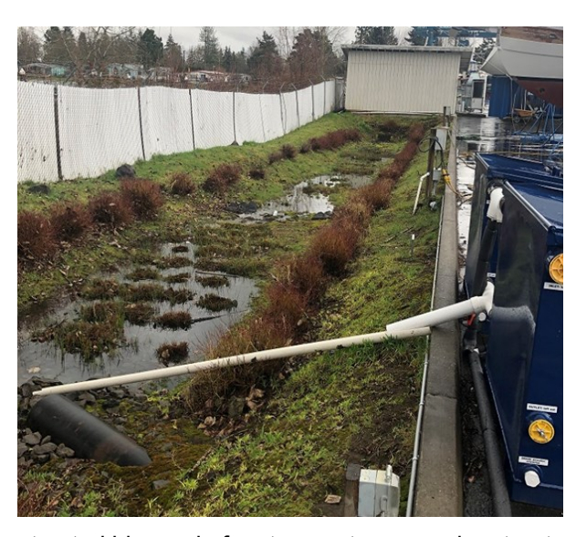
Constructed bio-swale for stormwater secondary treatment