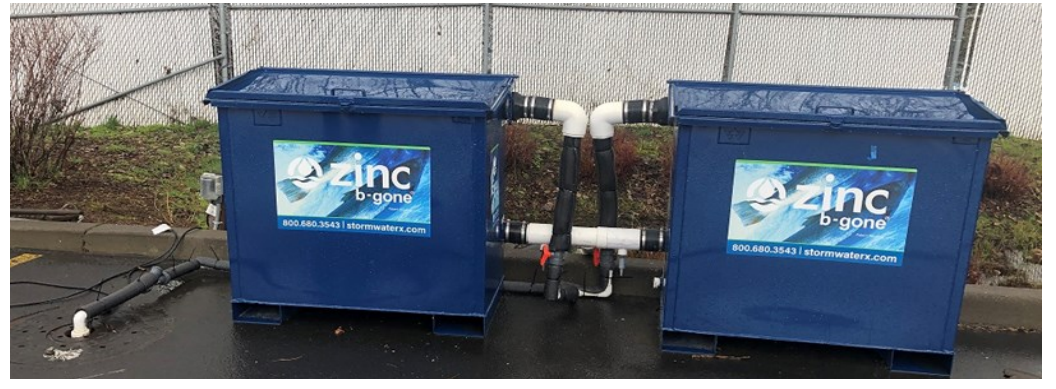
Second stormwater treatment system (zinc b-gone)