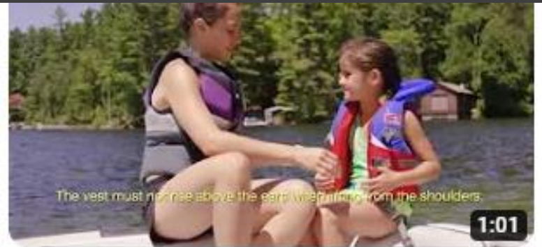
Usa un chaleco salvavidas – Deja de preocuparte -Wear a Life Jacket. Have Few...