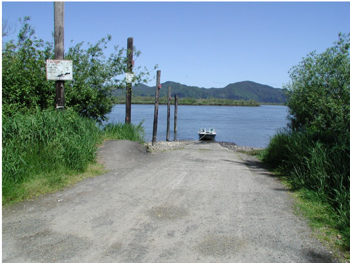
Ramp to be replaced