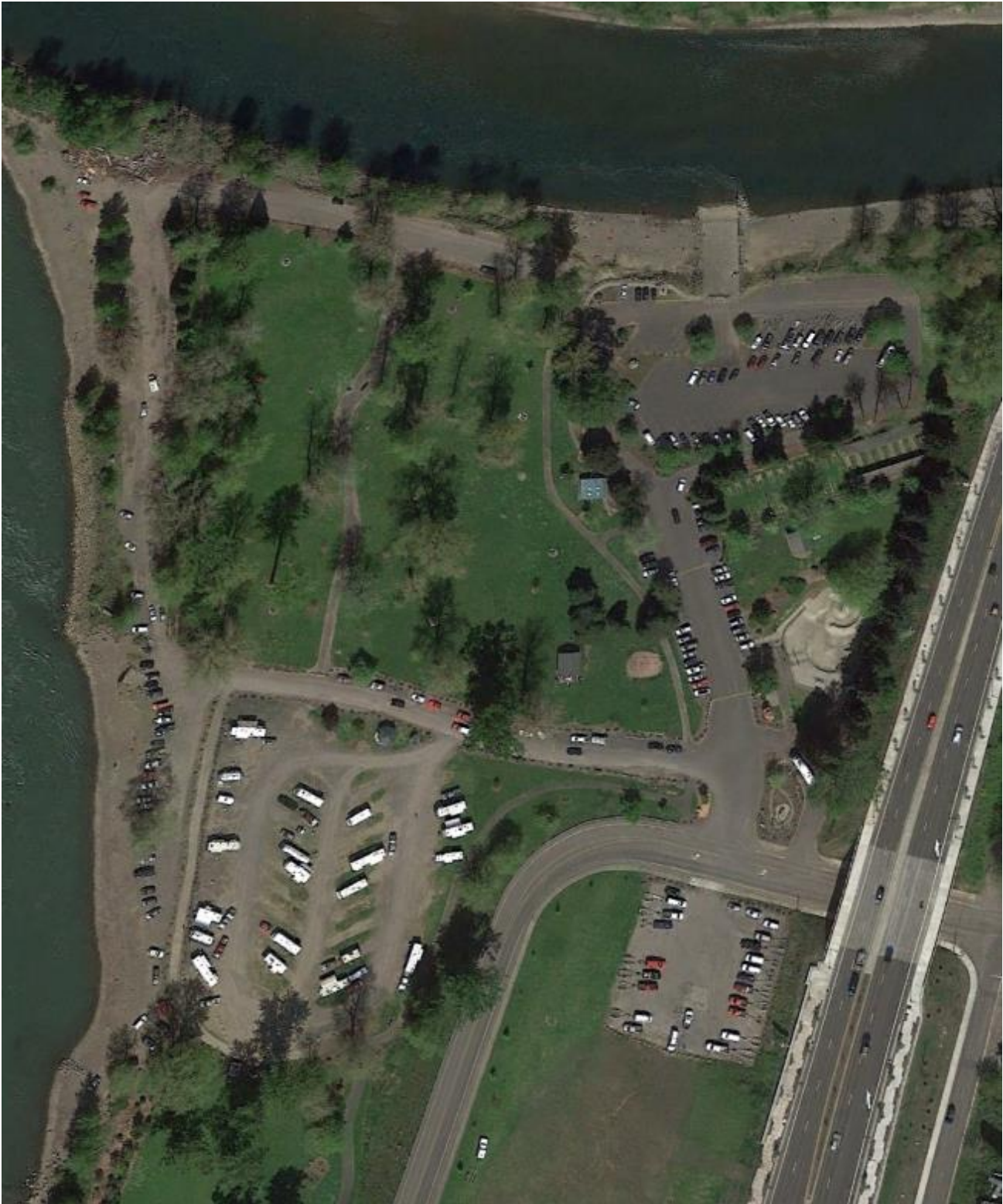
Aerial of Jakes Landing