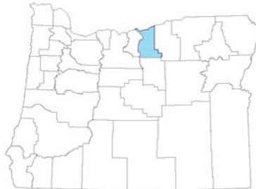
Figure 3.1 Gilliam County Location Map

The Airport is owned and operated by the city of Arlington and is not included in the National Plan of Integrated Airport Systems (NPIAS), making this airport ineligible for federal funding. Arlington Municipal Airport, designated by the airport code 1S8, occupies approximately 80 acres of land.