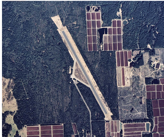
Cape Blanco State Airport

Fuel Facilities. The Airport has no aircraft fueling facilities.