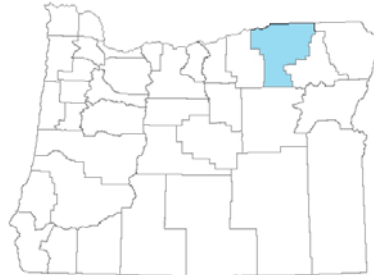
Figure 3.1 Umatilla County Location Map

The Airport is owned and operated by the city of Hermiston and is included in the National Plan of Integrated Airport Systems (NPIAS), making this airport eligible for federal funding. Hermiston Municipal Airport, designated by the airport code HRI, occupies approximately 267 acres of land.