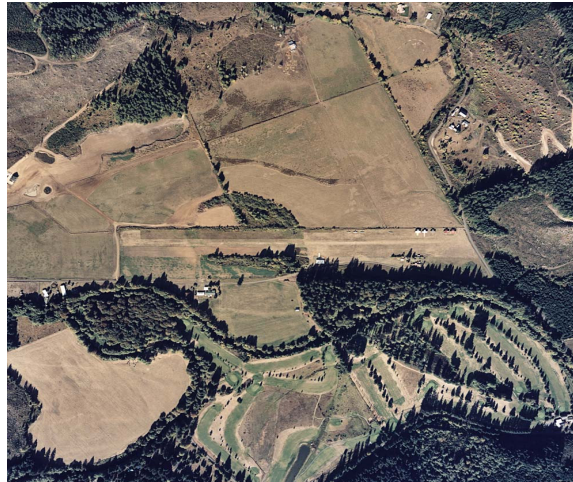
Vernonia Municipal Airport

Fuel Facilities. No fueling facilities are available at the Airport.