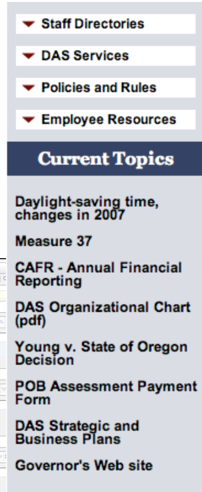
The DAS Level Right Navigation Bar

The Right Navigation Bar also includes a section (below the dropdown menu) with an editable blue bar headline (Current Topics) with the option of adding up to 8 links with a maximum character count of 45 each. (figure 2).