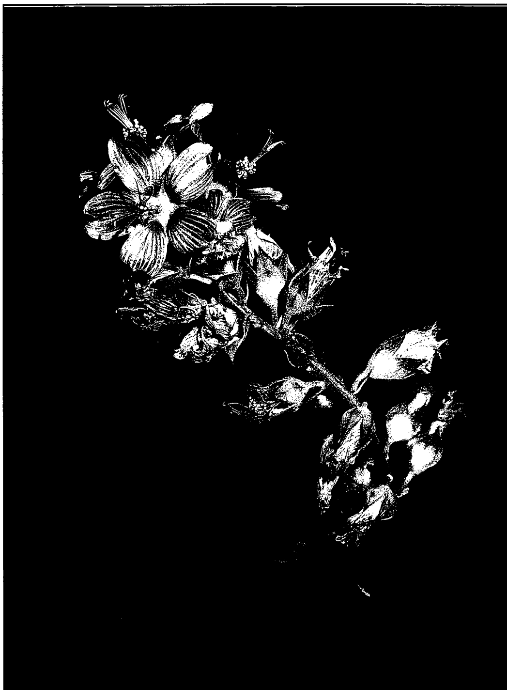
Figure 4. Example of Sidalcea nelsoniana from a site outside the MCCF. Plants at this site were sprayed with herbicide and began wilting shortly after identification by R. Meinke on June 20, 2003.