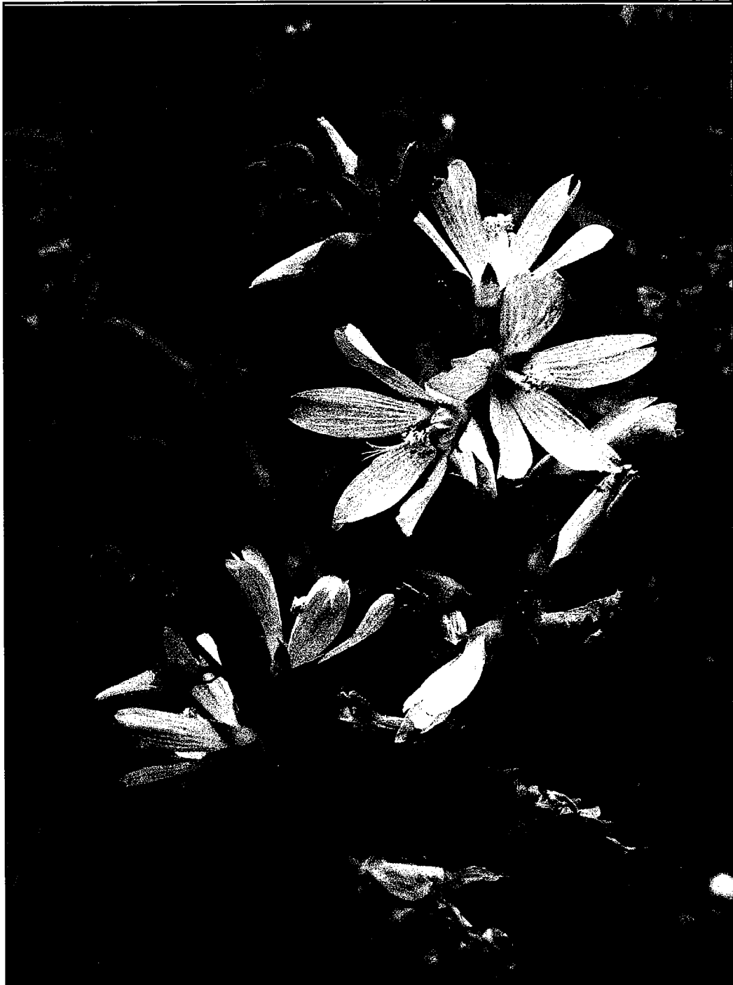
Figure 3. Sidalcea campestris growing along an irrigation ditch at the MCCF site. Plants along the eastern portion of the ditch were especially vigorous, with several hundred plants flowering and producing seed.