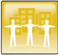
Oregon Cooperative Procurement Program