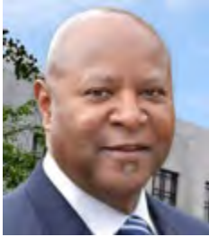
Senator James L Manning, Jr