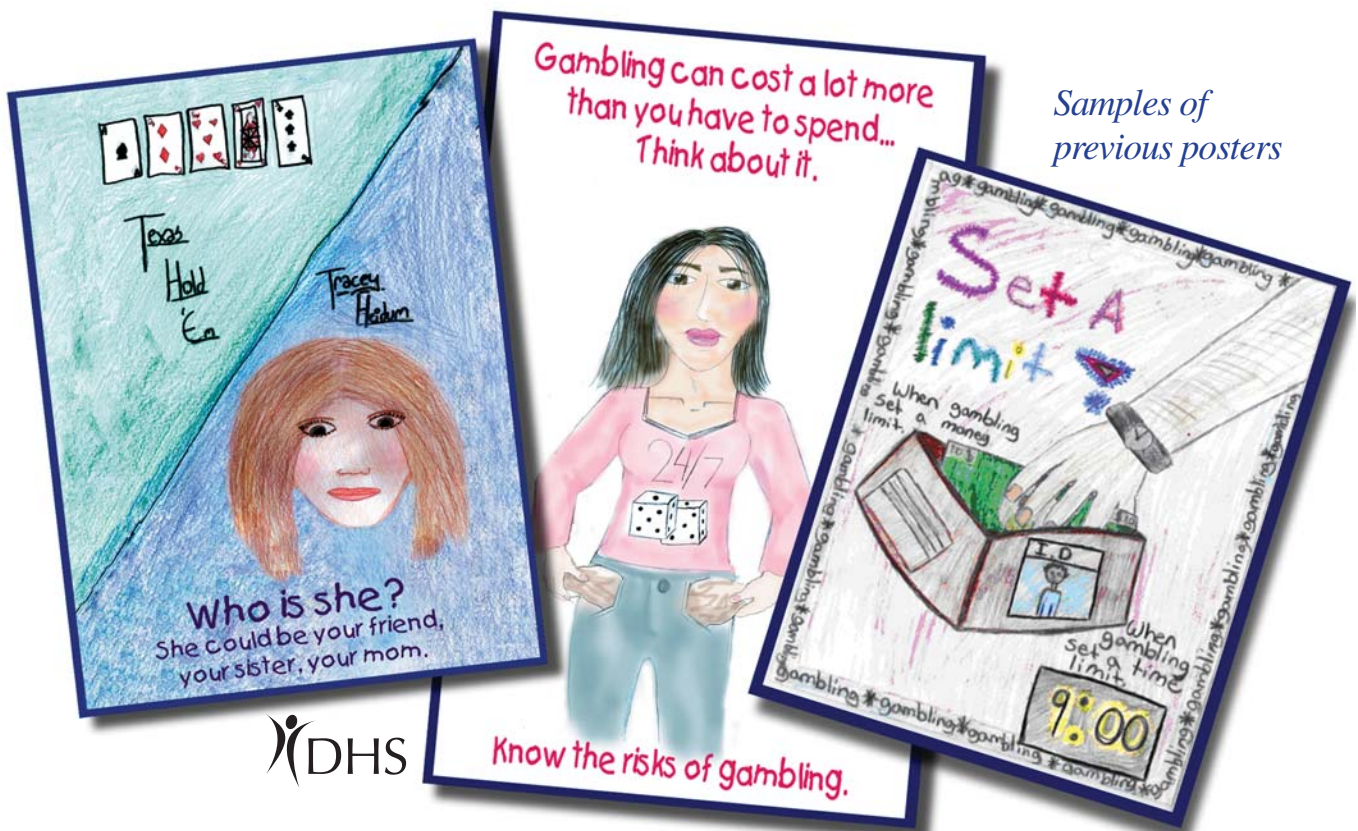
Samples of previous posters

The top 12 submissions will be included in a Special 2008 calendar that will be distributed throughout the State.