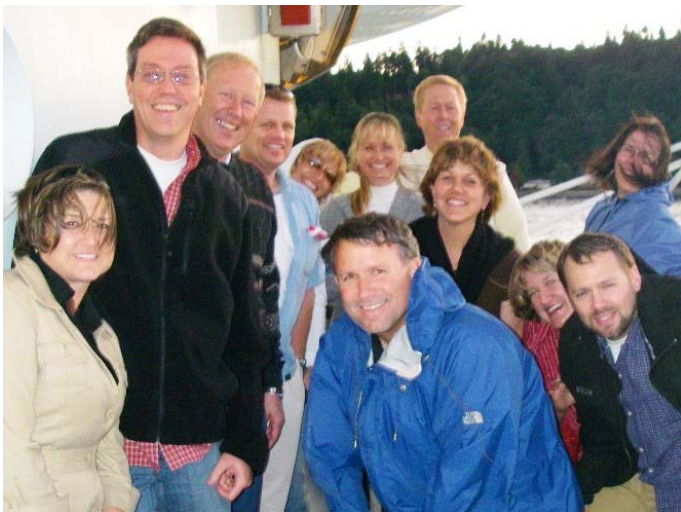
Food safety folks on the ferry

The 2008 FDA Pacific Region Retail Food Seminar was held in Seattle on August 12-14, 2008.