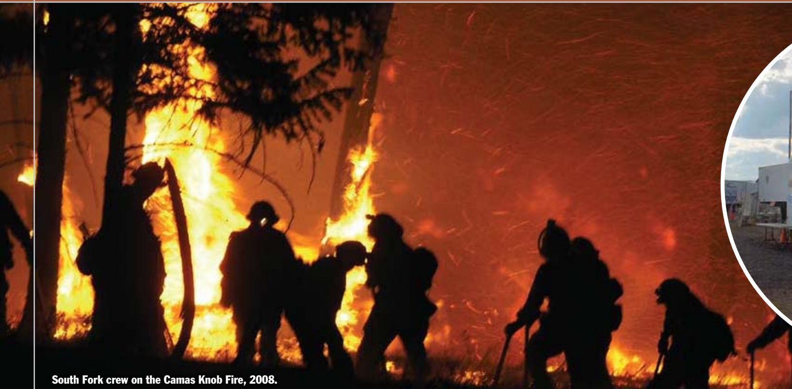
South Fork crew on the Camas Knob Fire, 2008.