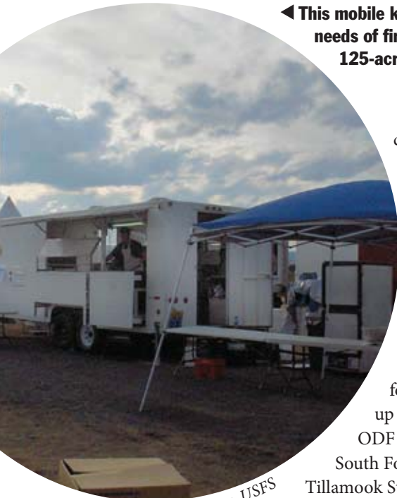
◀ This mobile kitchen served the needs of firefighters on the 125-acre Camas Knob Fire.