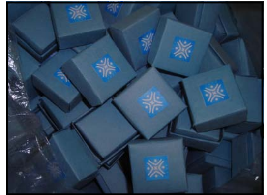
The boxes created by Special Education and GED inmates at SRCI.