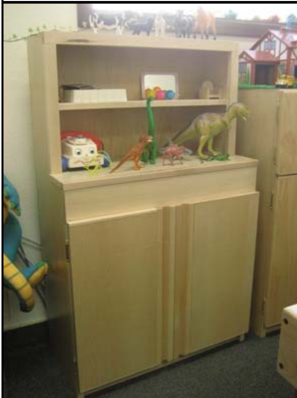
OCE built and donated play furniture for the children's shelter in McMinnville

Lutheran Community Services: "On behalf of the staff and clients of Lutheran Community Services Northwest, we would like to thank you for your support of our programs. Your recent gift of children's furniture for our child therapy program is greatly appreciated. The children who visit our office every day have put the furniture to immediate use. It seems a good way for inmates working for OCE to help provide healing to the next generation. We appreciate the care, craftsmanship and attention to detail that so clearly was put into these unique pieces of furniture and art."