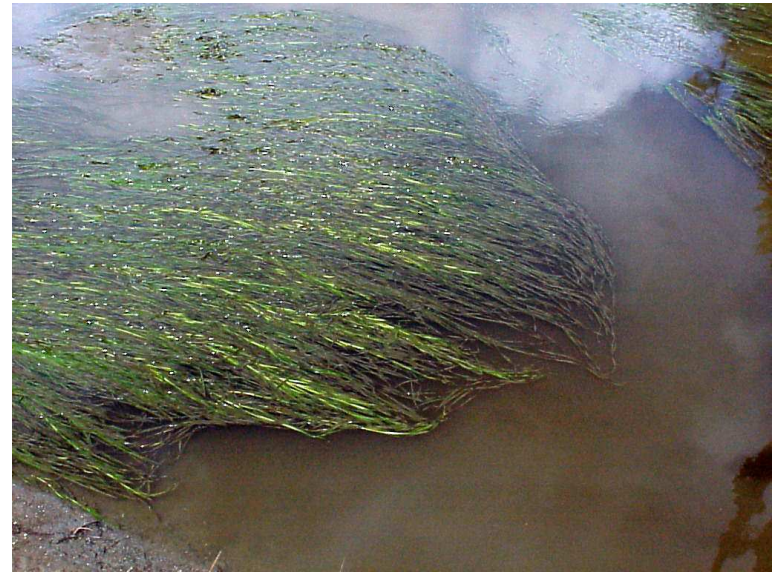
Fig. 2 Eelgrass blades indicating the direction of tidal flow