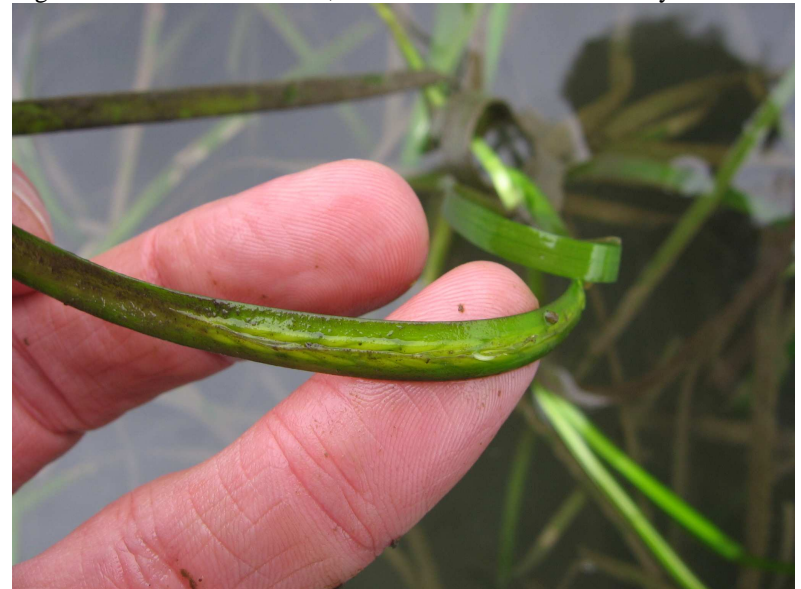
Fig. 8 Eelgrass seeds are one form of reproduction.