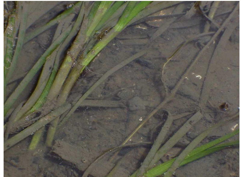
Fig. 6 Rooted in the sediment, the basal sheath contains many blades.