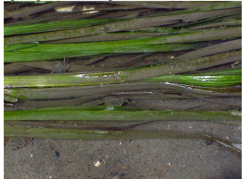
Fig. 4 Dense eelgrass blades provide ideal habitat.