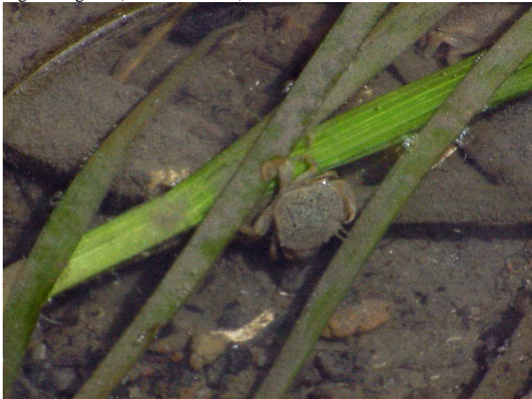
Fig. 3 Juvenile crabs use eelgrass blades for cover and forage