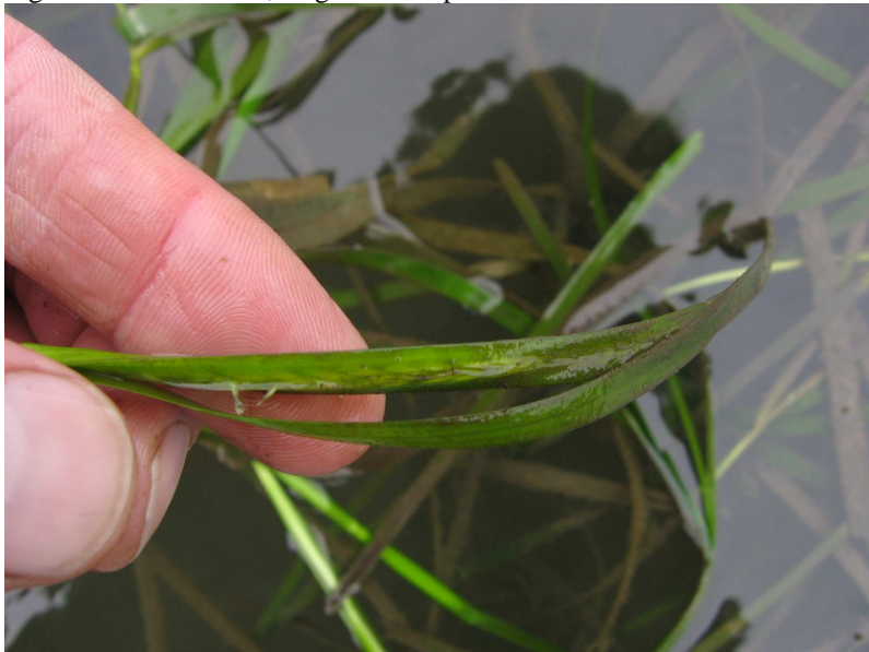
Fig. 7 Seeds are contained within specialized channels on certain blades.