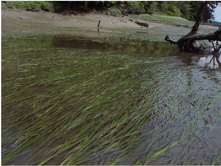
Fig. 1 Eelgrass ( Zostera marina ) at low tide