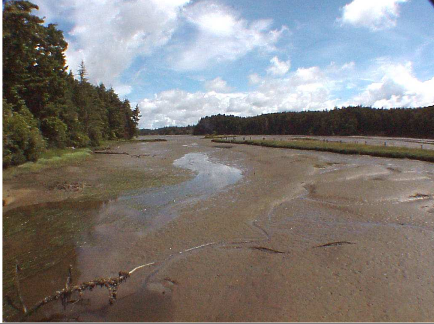
High Tide @ Sloughside Point