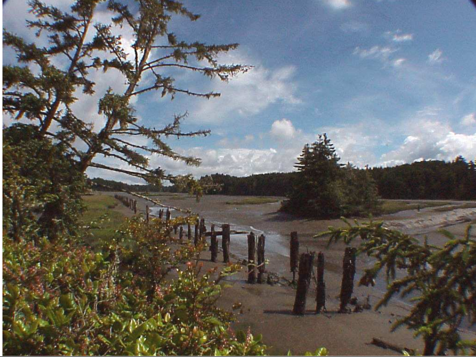
High Tide @ Sloughside Pilings