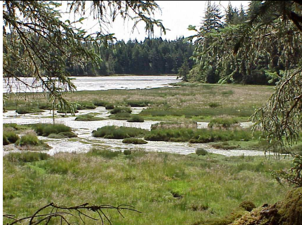
Low Tide @ the Observation Deck 1.6 ft. below MLLW