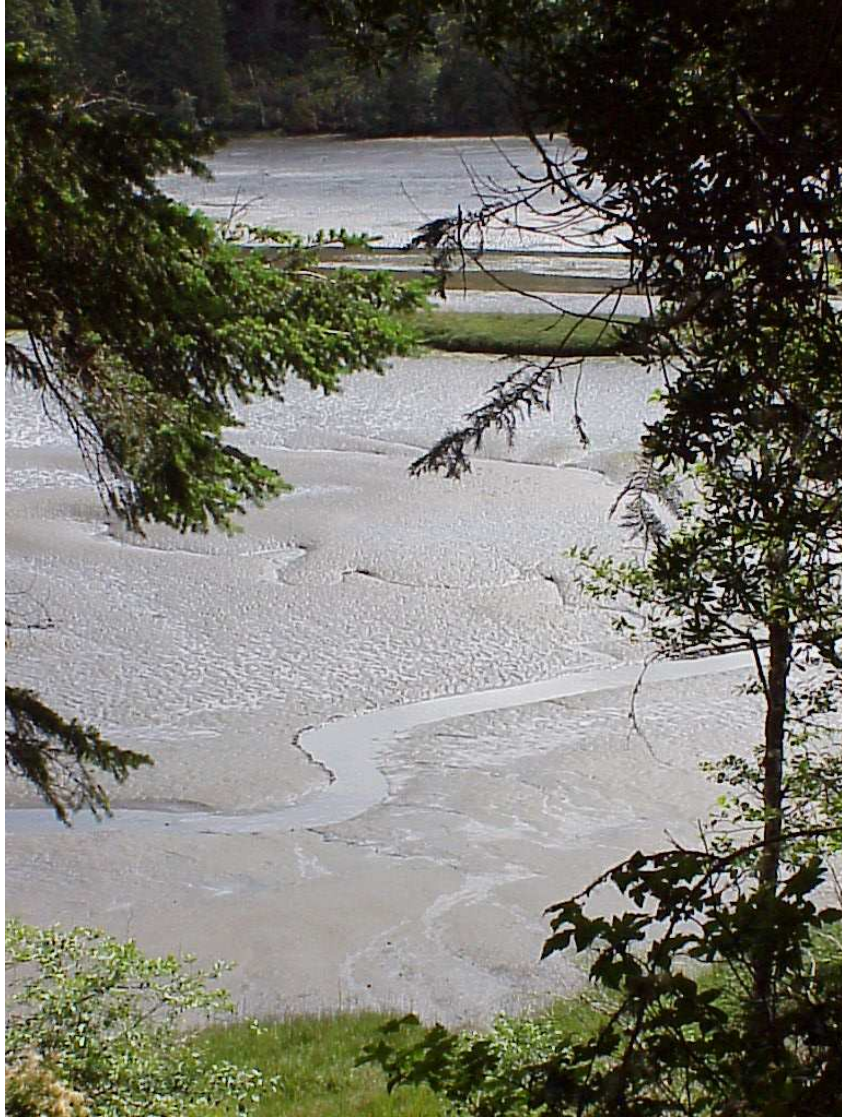
Low Tide @ the Overlook 1.6 ft. below MLLW