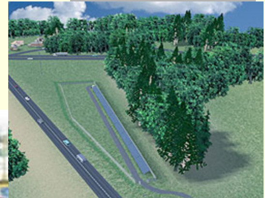
Oregon Solar Highway 104 kW PV Interstate 5 and 205