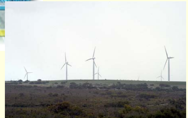
Glenn Ikemoto 10 MW Wind 5, 2MW Echo Ridge