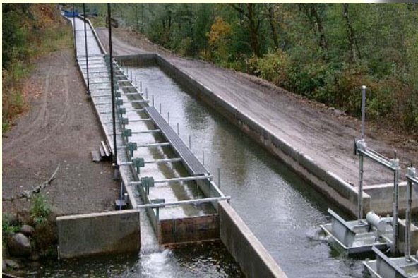
Hood River Irrigation 3.5 MW Hydro Parkdale