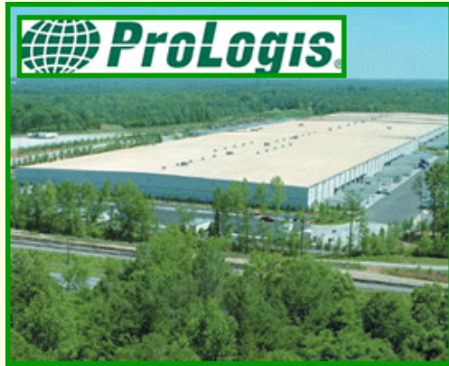
Pro Logis Warehouse 1.2 MW PV Beaverton