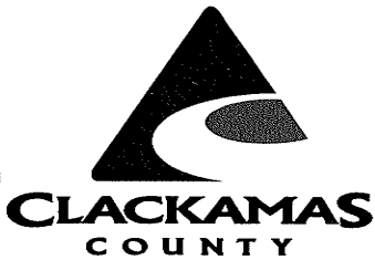
EXHIBIT: _____ LAND CONSERVATION & DEVELOPMENT COMMISSION DATE: 1-23-08 PAGES: 1 SUBMITTED BY: Clackamas County