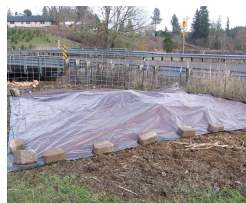
Bottom photo (after): Manure pile moved 40 ft. away from the creek and is securely covered. A newly constructed fence along the creek excludes livestock from entering.