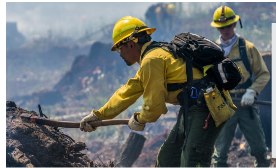
FIREFIGHTERS EXTINGUISHING A FIRE