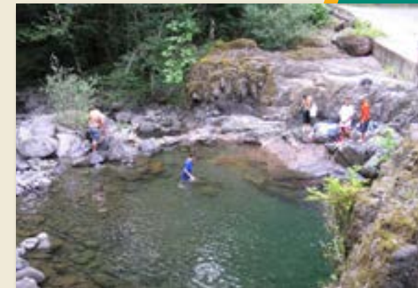
Swimming hole at Rock Creek Campsites