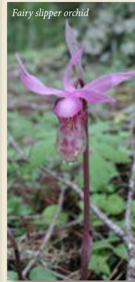
Fairy slipper orchid

The Forest Acquisition Act, passed in 1939, encouraged counties to deed the foreclosed lands to the Oregon Department of Forestry in exchange for a share of future timber harvest revenues, giving rise to the state forest system we have today. Since then, the Oregon Department of Forestry has managed the land.