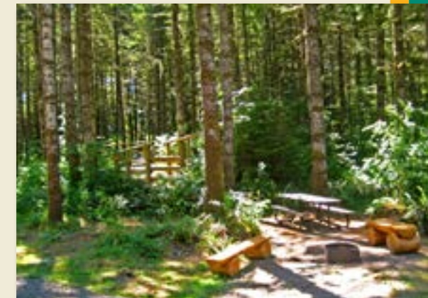
Santiam Horse Camp