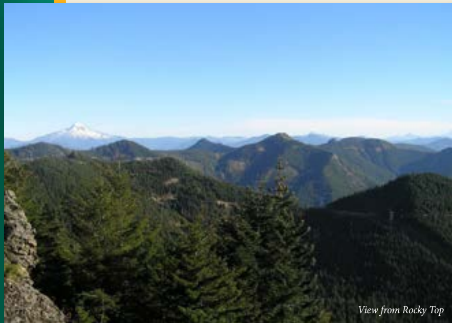
View from Rocky Top

The other large block of Santiam State Forest is located in the Butte Creek Basin and is reached by driving south of Highway 213 through Scott's Mills and the Crooked Finger Road. Explore the High Lakes Recreation Area and Butte Creek Falls in this area.