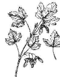
"Habitat for Birds and Animals"

PHONE: (541) 584-2214 Fax: (541) 584-2326 Website : www.odf.state.or.us/nursery e-mail: kmathews@odf.state.or.us