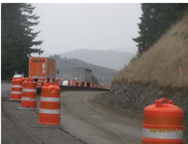
I-5 truck climbing lanes at Sutherlin

ARRA invested half a billion dollars in Oregon’s surface transportation system during the Great Recession, funding more than 200 projects of all types and sizes across the state. Large and small employers working on ARRA projects helped hard-hit communities by employing local residents and supporting local businesses.