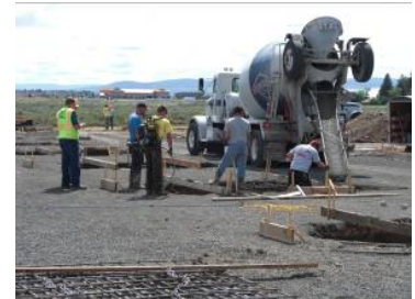
Pouring concrete for the Madras Heavy Aircraft and Engine Maintenance Facility

Ranging from repaired railroad tracks to upgraded marine piers, from new transit centers to improved aviation communications equipment, these non-highway projects make Oregon better for people and business.