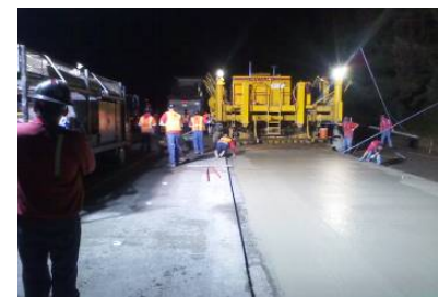
I-5 at I-205: Adding a lane

The Jobs and Transportation Act, passed by the 2009 Oregon Legislature, improves all modes of Oregon’s transportation system through a variety of programs. It raises about $300 million per year for highways, county roads and city streets. The JTA identified 37 specific state highway projects and allocated funding to 12 local governments in Eastern Oregon.