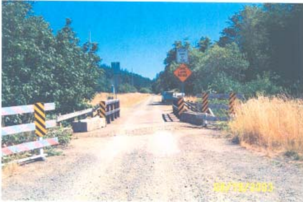
View of Approach to Price Creek Bridge from East to West