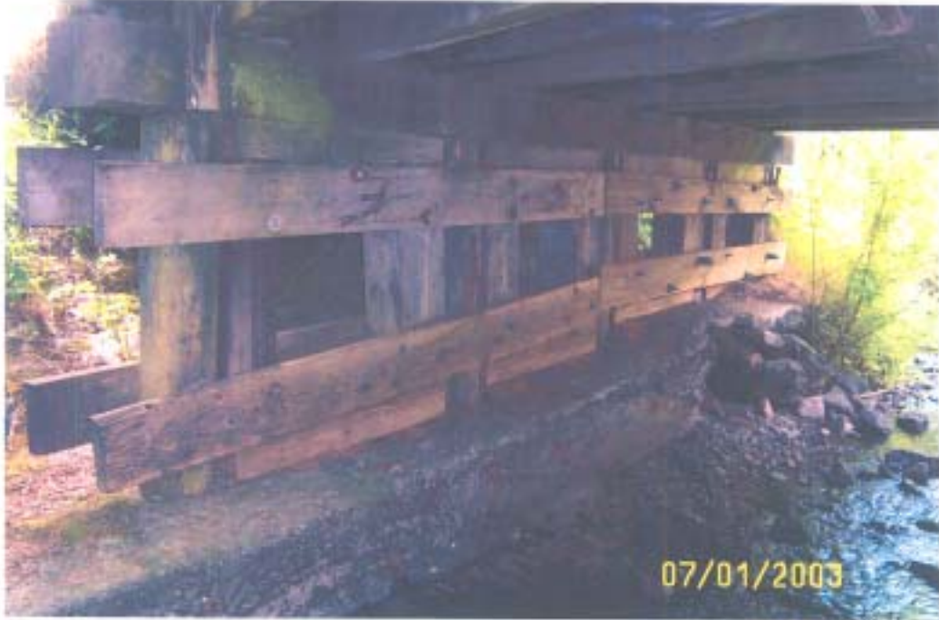
View of East Side of Bent 2 Fill was placed behind Bent 2 and covered with concrete for erosion control Fill has restricted flow through stream channel