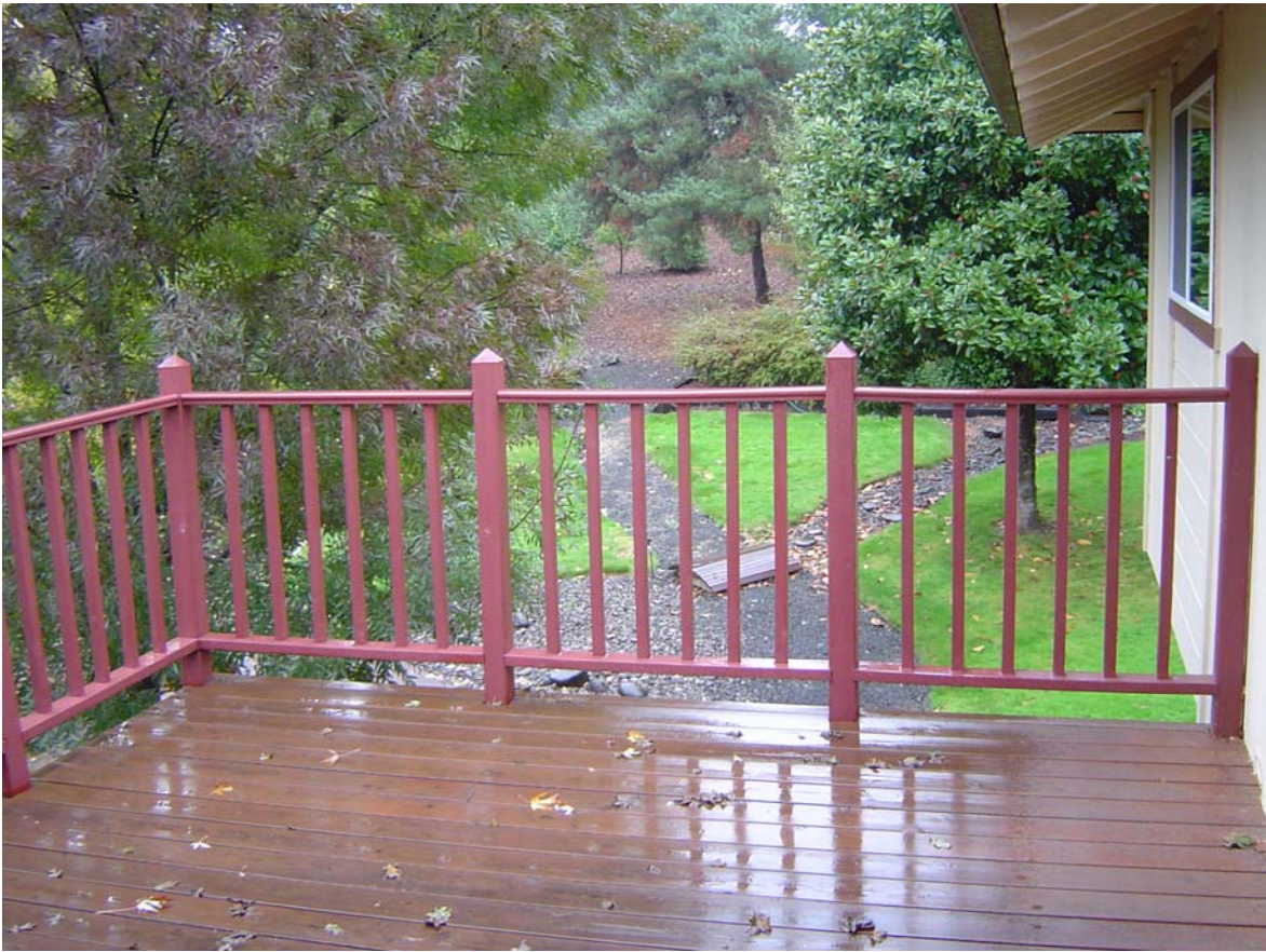
Deck & Back Yard