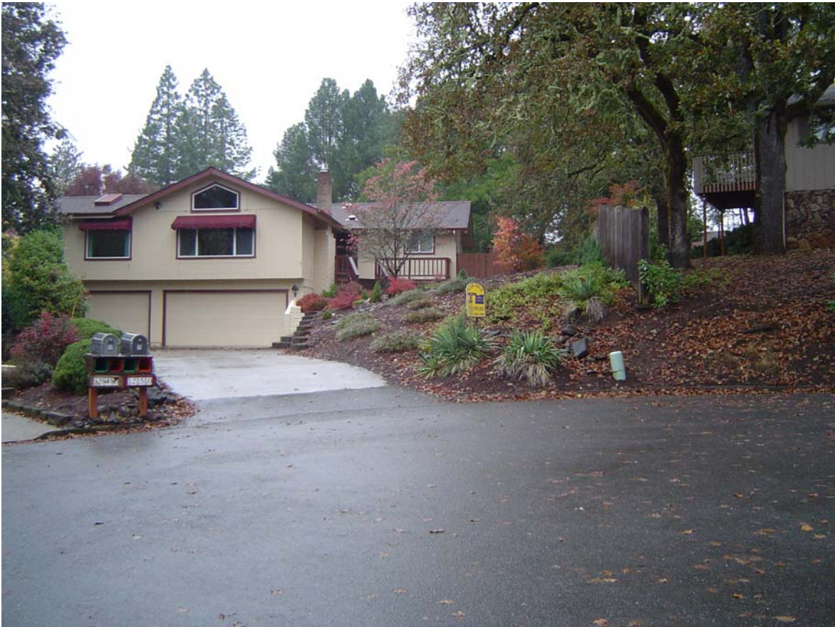
Front View of Home