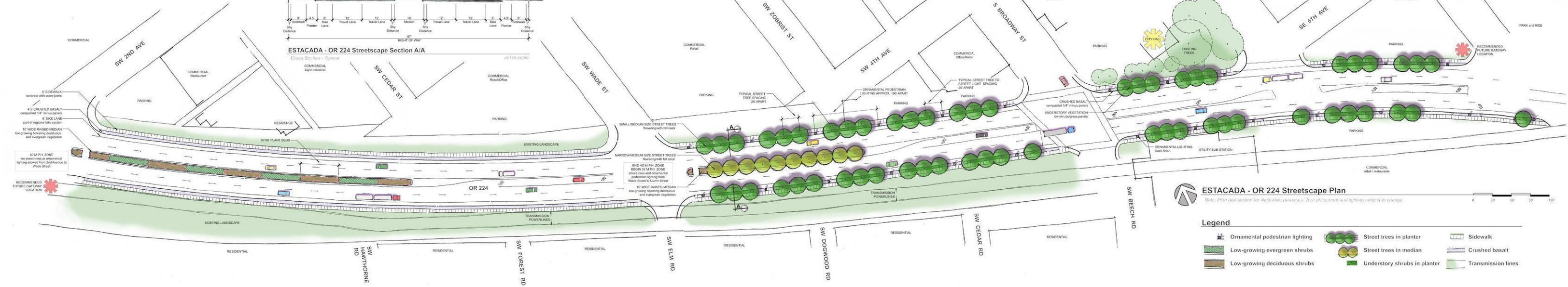
ESTACADA - OR 224 Streetscape Plan Note: Plan and section for illustrative purposes. Tree placement and lighting subject to change.