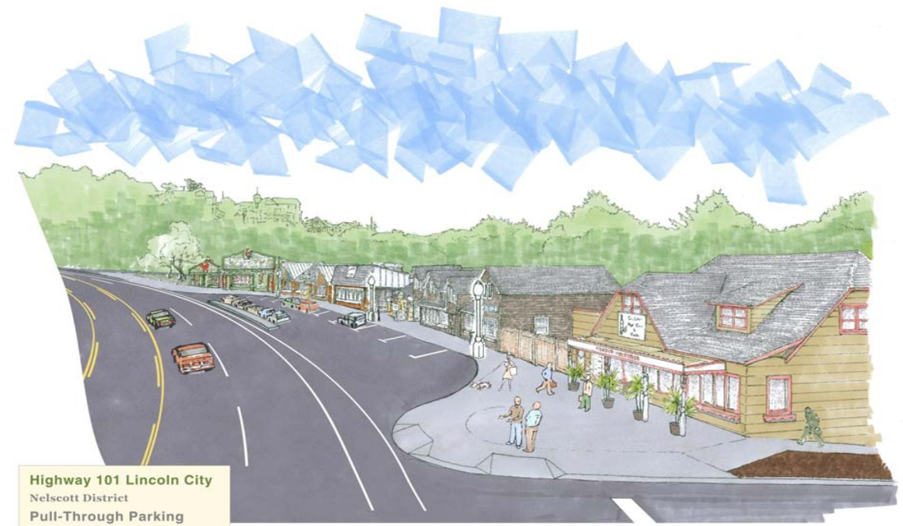
Preferred Option: Nelscott Drive Through

State and local officials worked with Nelscott business owners to develop their preferred option. The City Council voted to support the drive-through roadway design that is similar to what exists for the Nelscott business strip today. This option maintains the character of the Nelscott business strip but has a higher cost to relocate utilities.