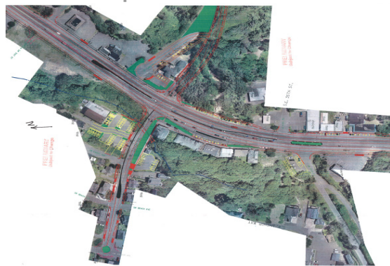
South Realignment with Cul-de-sac