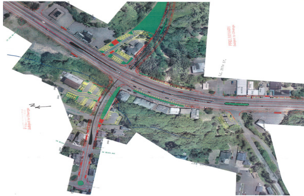
Preferred Option: South Realignment with Jug Handle Turnaround

ODOT worked with City officials and staff, and the community to consider several options for 32nd Street and for Nelscott: