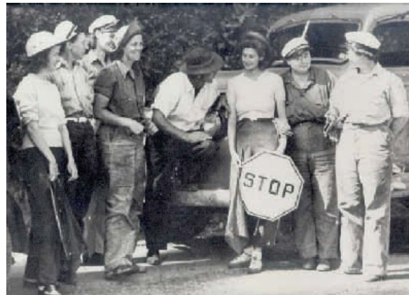
Paving Crew during WWII, Marshfield, Oregon, September, 1942.

The project will also make guardrail and ADA ramp improvements within the project area.