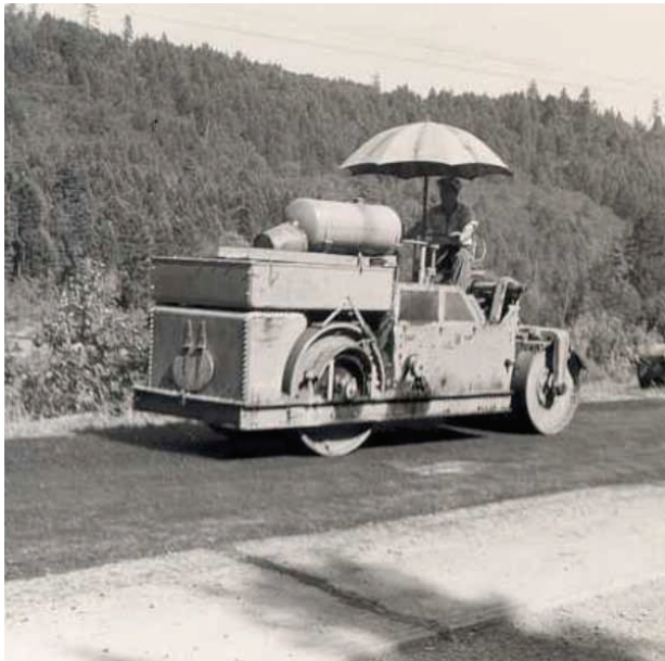
Patching roller South of Canyon Creek Pass, Pacific Hwy near Azalea, August, 6 1940

Go to www.ODOTproject.info to keep up with road construction in your county.