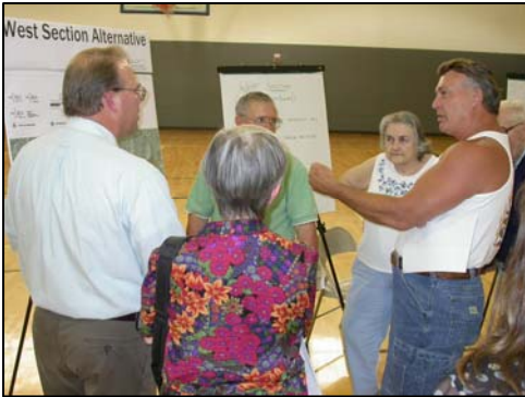
August 2005 Open House

stationed at displays to discuss the project and answer questions. Eighteen written comments were received at this open house, primarily dealing with changes to Highway 199, speed, and safety.