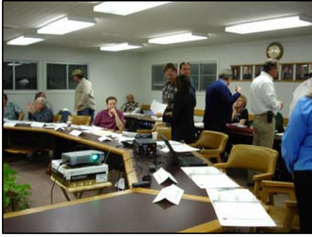
February 2005 CAC meeting.