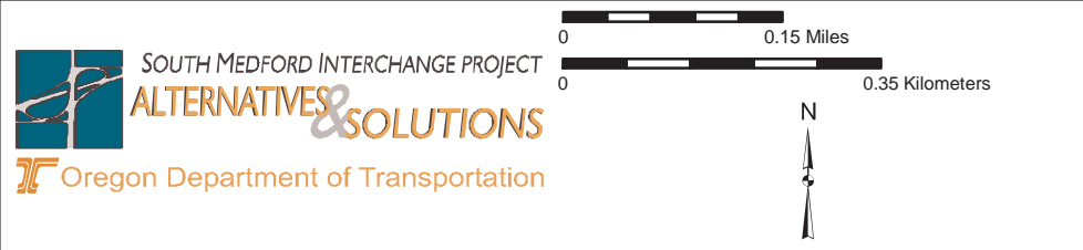
Figure 4 Proposed Staging Areas