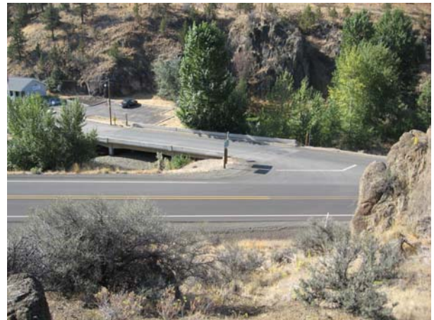
Looking down on the Bridge Creek Bridge at the west end of Main Street in Mitchell, Oregon.

The existing Bridge Creek Bridge has deck and other structural deficiencies: the bridge deck is worn and delaminated, there are cracks in the superstructure beams, and there are no guardrails on the ends of the bridge. The last inspection of this bridge was done in November 2008 and it currently has a sufficiency rating of 50.5 (out of a possible score of 100). There are currently no load restrictions on the bridge.