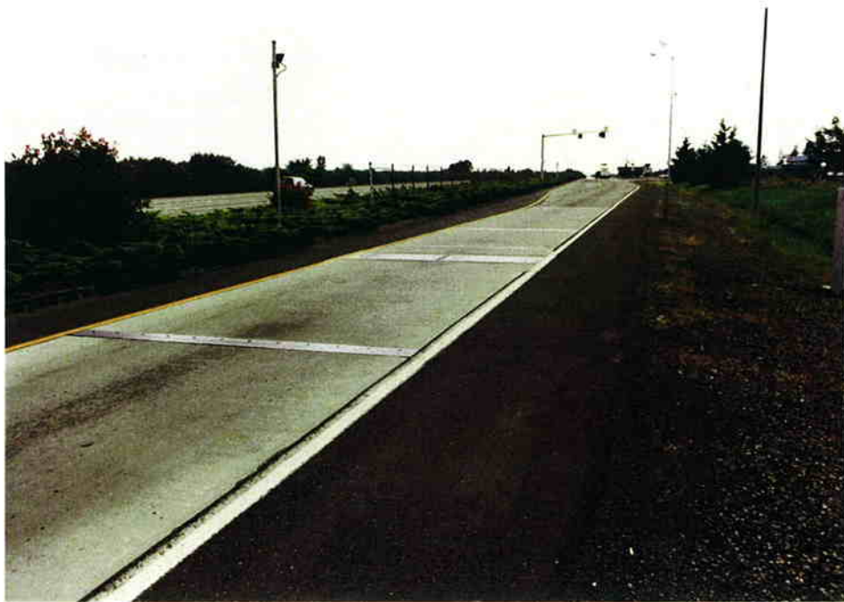
Figure 2.9: Looking South, View of Approach Slab, WIM, and Overheight Detector (Note Directional Signals in Background)