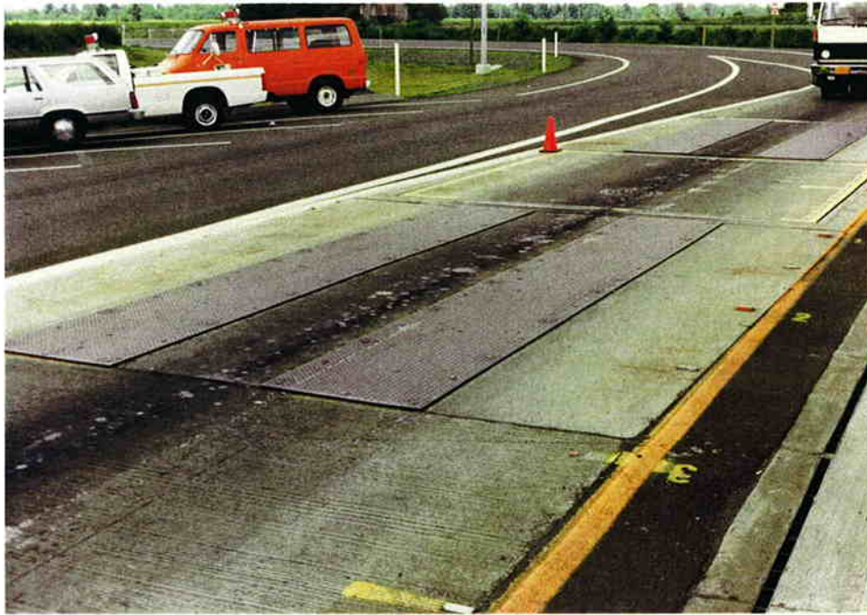
Figure 2.5: View of West Static Deck and Approach Slab with Leveling Steel Plates AVI Activator