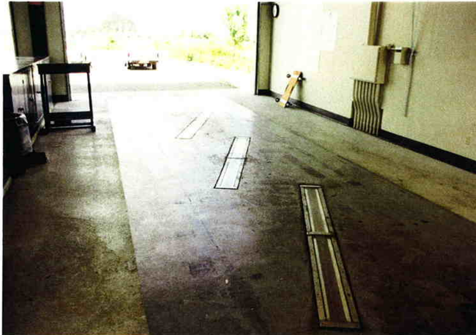
Figure 2.4: View of Floor Inspection Bay with Floor Lights and Skate Board