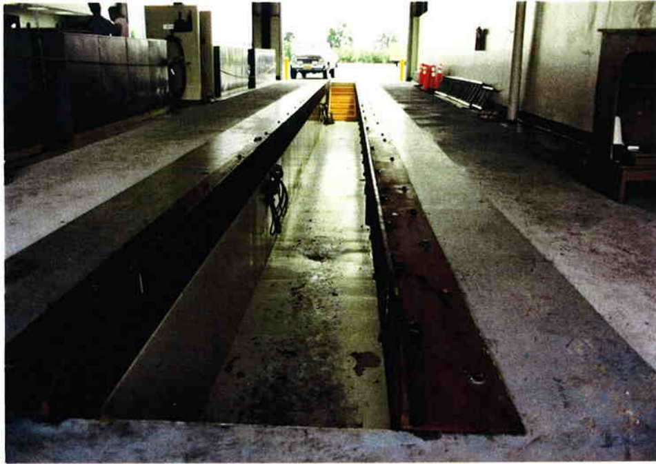
Figure 2.3: View of Truck Inspection Pit (Note the side channel beams)