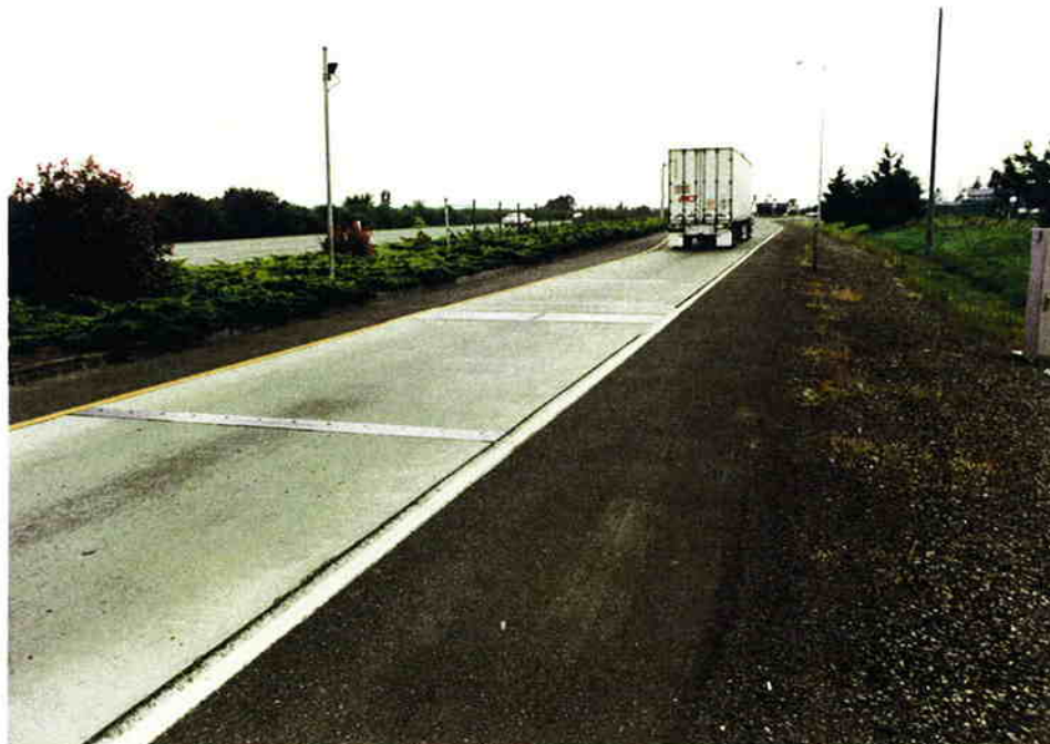
Figure 2.8: Looking South, View of WIM, Approach Slab, and Overheight Detector (Note Expansion Joint in Foreground)