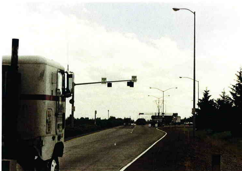
Figure 2.10: View of Directional Signals (Note Variable Message Signs)