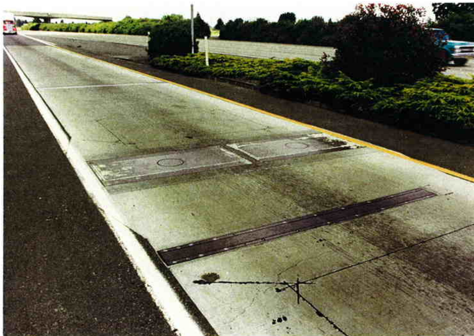
Figure 2.6: View of Axle Sensor, WIM Scales, Induction Loops and PCC Approach Slab