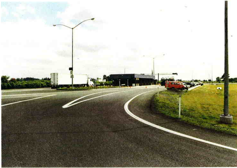
Figure 2.1: View of the POE 1 Offices