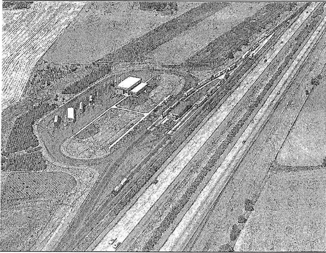
Figure 1.1: Aerial View of Woodburn Southbound POE

reason invalid. This will allow the weighmaster to take immediate action in case of suspended plates; in the past, this information was not readily available to provide timely action at the POE. The SC will also have name and address files on 40,000 carriers. In addition, the SC will also have a "chronic offenders" list allowing the weighmaster(s) to automatically check if the truck meets both the weight and legal registration conditions. If the truck meets both the weight limits and registration requirements, then it will automatically be permitted to bypass both the static scales and the PUC office, thus minimizing time losses.