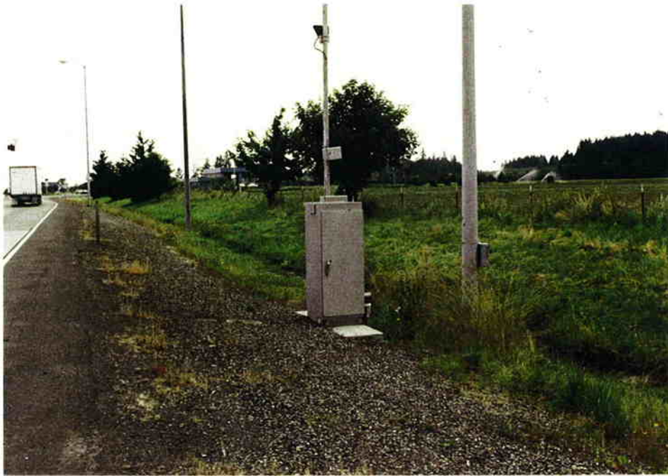
Figure 2.7: Looking South, View of WIM Electronic Cabinet, Overheight Detector, and AVI Activator