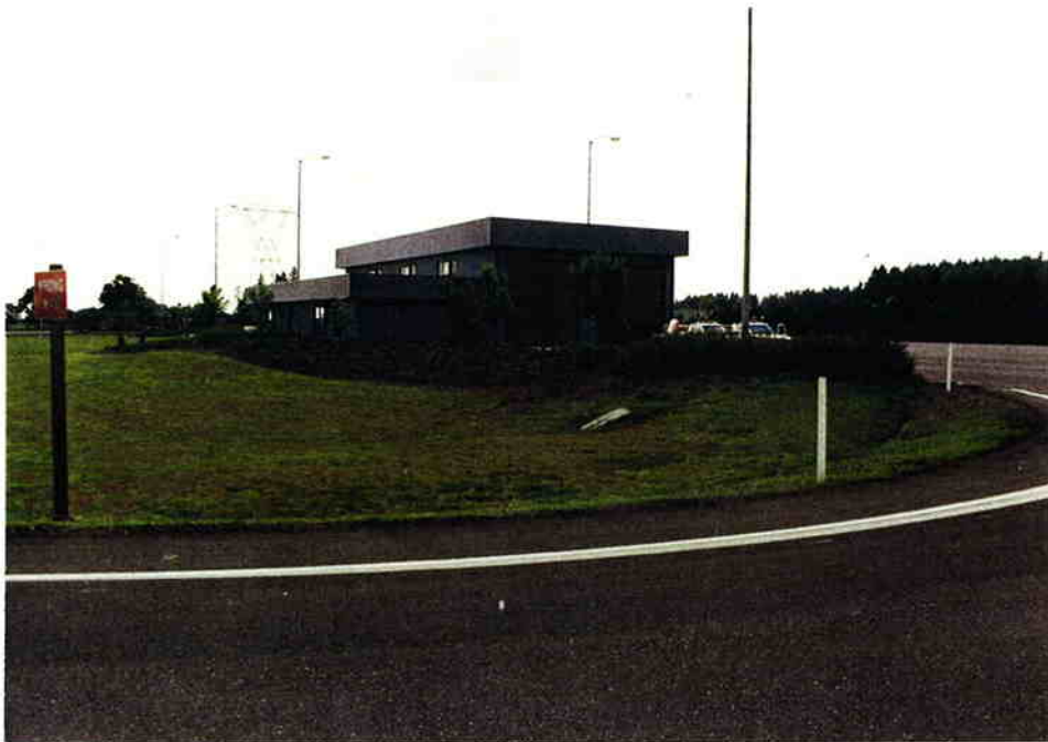
Figure 2.2: View of Truck Inspection Bay Building and Offices