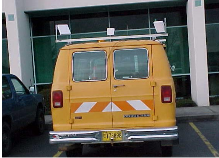
Figure 2.2: The patch antennas, mounted on the rear light bar of the van.