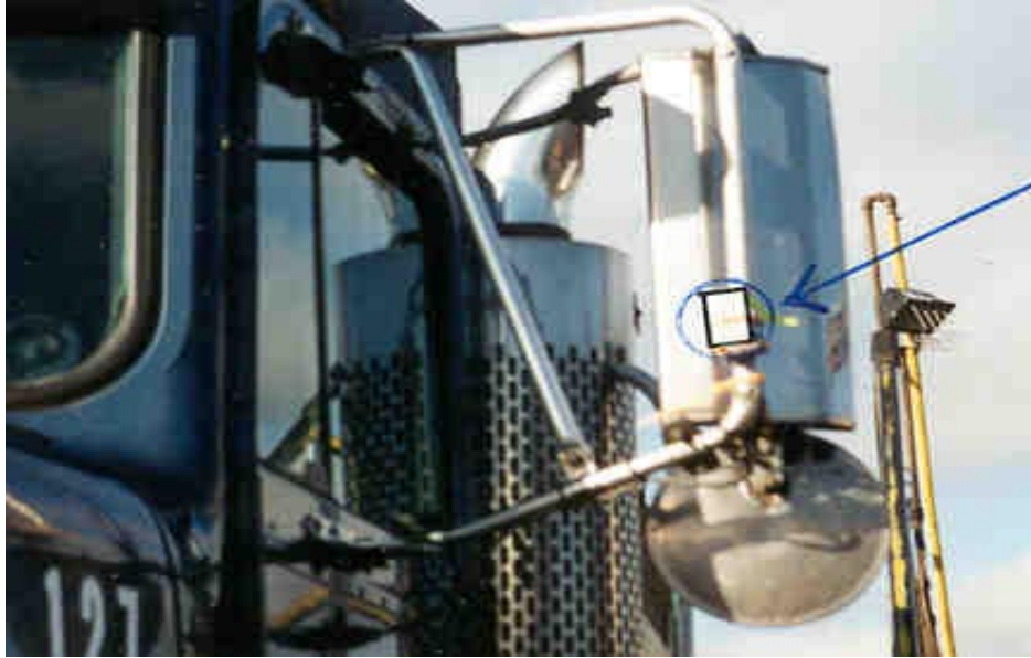
Figure 2.4 The arrow points at the MicroStamp 10ML tag.

The operator needed to use caution when aiming the antennas, because even though the power output from the system is low; the frequency is in the microwave range and enough exposure can cook the operator's hands. In addition, the FCC radio frequency exposure limits may be exceeded at distances closer than 130 mm from the antenna during normal operation. When the interrogator is transmitting, the transmit light on its front panel will be flashing. A non-conductive object such as plastic straight edge should be used to orient the antennas while the interrogator is transmitting.