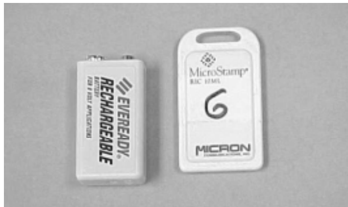
Figure 1.1: The MicroStamp 10ML tag shown next to a nine-volt battery.

The system was bench tested and demonstrated on selected pavement projects. This report documents the results of that testing.