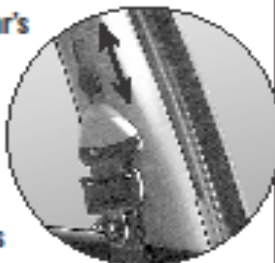
Example of built-in shoulder belt positioner

SOLUTION: Use your car's built-in shoulder belt positioner. Or try moving the seat to change how your shoulder belt fits.