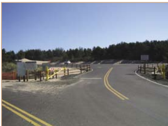
ATV Funds help develop new resources for OHV users in the dunes. ATV Funds helped pay for the Horsfal and Bull Run Staging Area, pictured.

Alcohol and ATVs don't mix. Accidents and injuries, unsafe environments, and resource damage has led to an alcohol ban in the ODRNA and Sand Lake Recreation Area outside developed sites (CFR 261.50) For more information, contact the USFS at (541) 271-3611.